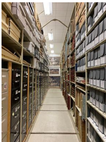
The Center for Sacramento History's archive.