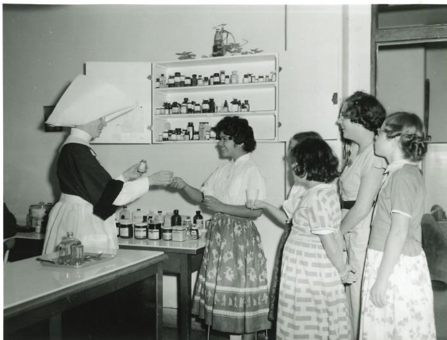
A Daughter of Charity at the infirmary distributing medicine to children at St. Vincent's school in the 1940s.

St. Vincent's Archive frequently collaborates with local media organizations to shed light on the