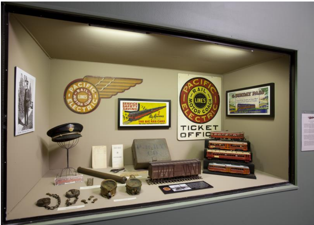
One of the vignette displays from the show "Pacific Electric Railway, Then and Now" sponsored by the Mount Lowe Preservation Society and hosted by the Pasadena Museum of History. Featured are car cards, vintage scratch-built models, signs, switch locks and gauges from a PE streetcar.

Our archival materials have been used for several book projects for Arcadia Publishing including Mount Lowe (History of Rail Series and Postcard Series), Mount Lowe Railway Then and